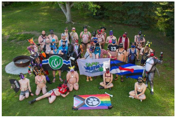
Camp 2022 Group Photo - VEX

On behalf of the Wruffin' It Adventures Group POD we'd like to welcome you to your 5<sup>th</sup> annual Camp Wruffin' It! We're excited to bring you a fantastic experience this year. We've been working hard on the whole program and believe you will have an exceptional time meeting and bonding with your fellow pups and pet players. We're often told that there's nothing like Wruffin' It. How welcoming, inclusive, and empowering our community has become is a hallmark of what we do. We're glad you're apart of it, new or returning, and we hope to make you a camper for life.